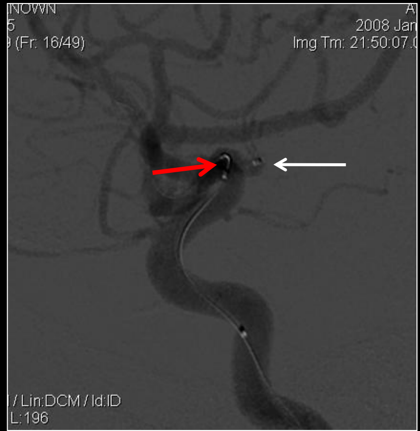
Hyperform: 4mm X 7mm. placed across neck of aneurysm (Red Arrows) Echelon 14 X Xpedion 14 micro-catheter (white arrow) was placed in the sac and subsequently coiled